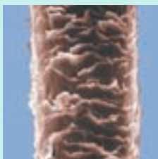
Hair - Scanning electron microscope