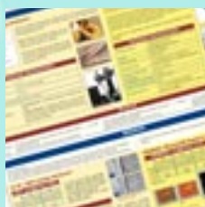
Example of poster