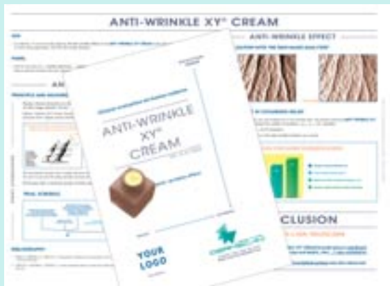
Example of four sheets (A3)